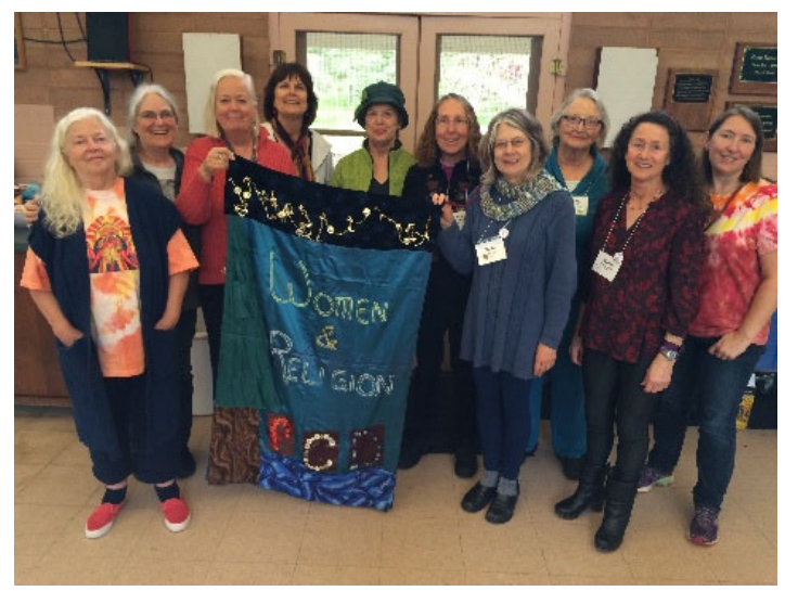
Pacific Central District UU W&R